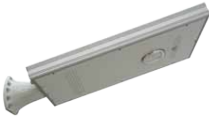
Basic - Front