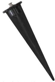
OPTIONAL ATTACHMENTS PRODUCT: FL01