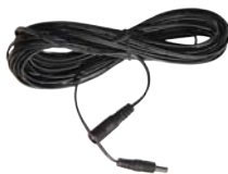
OPTIONAL ATTACHMENTS PRODUCT: RC01