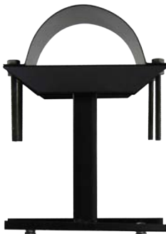
OPTIONAL ATTACHMENTS PRODUCT: FL13