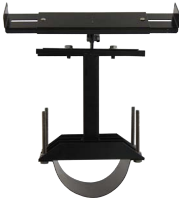
OPTIONAL ATTACHMENTS PRODUCT: FL12