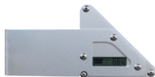
Battery status display

This compact "Tri-shape" series sign light fixture provides a cost effective solution to externally lighting small to medium sized signs. Each light fixture is fitted with multiple LEDs. The light automatically illuminates at sunset at full brightness. After 5 hours the light will dim down to 25% brightness for the remaining hours of the night. The light fixture attaches to a vertical surface above the sign for downward illumination. It includes stand-off mounting brackets to allow the fixture to be attached away from the sign face for better lighting distribution. Offered in four sizes. Standard color of light fixture is black, silver can be ordered upon request.